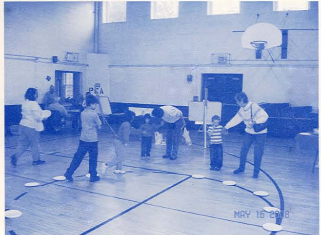
Providence Academy Children's Fair