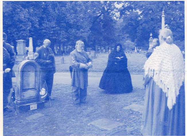
Fort Delaware Dead in Easton, Pennsylvania