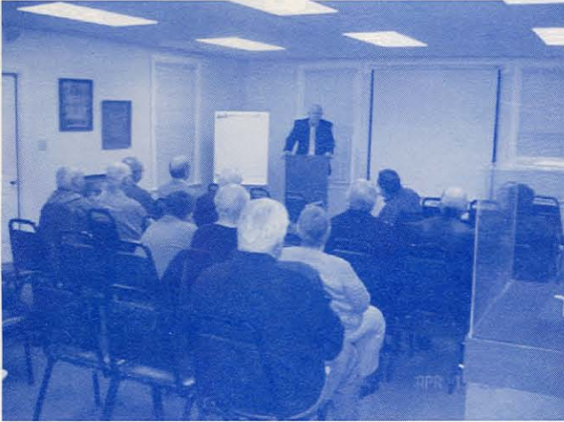
April General Membership Meeting