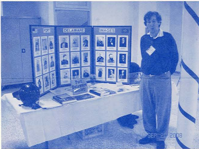
Manor College Gettysburg Seminar