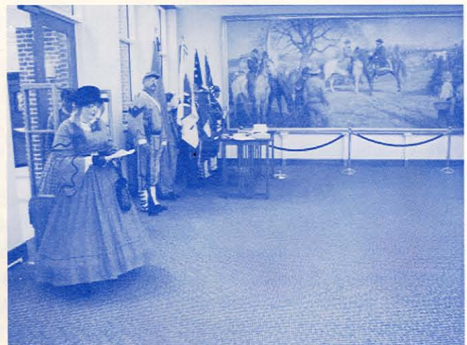
Lee & Grant Painting in Dover Archives