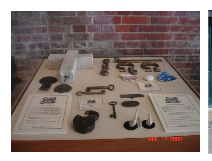
Society's Visitor Center Display