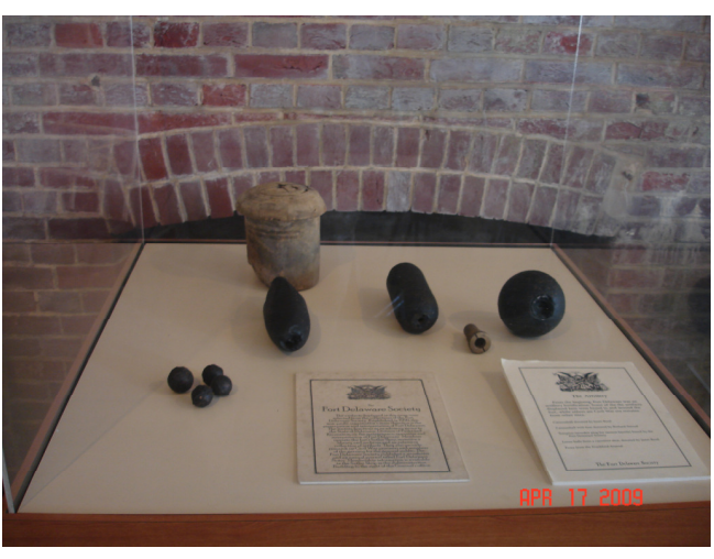
Society's Visitor Center Display