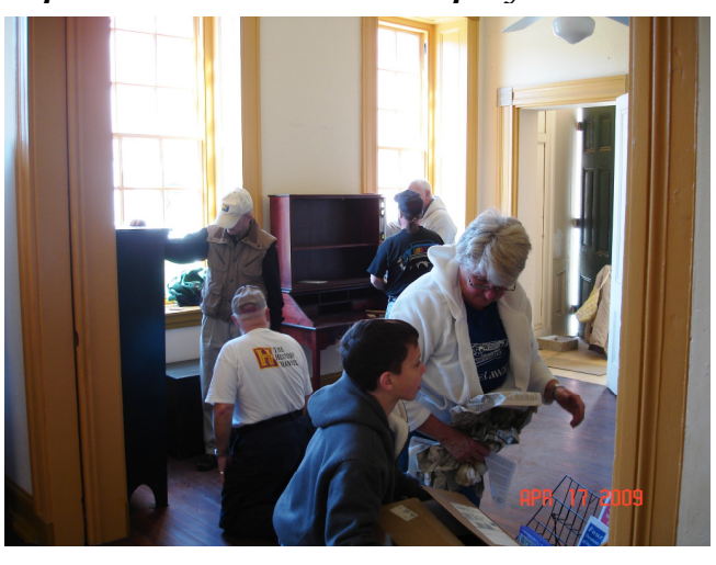
Sorting Merchandise for Display