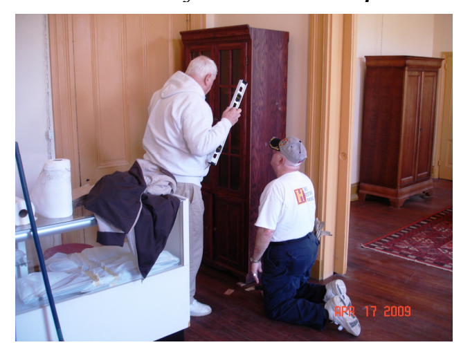
Leveling Storage & Display Cabinets