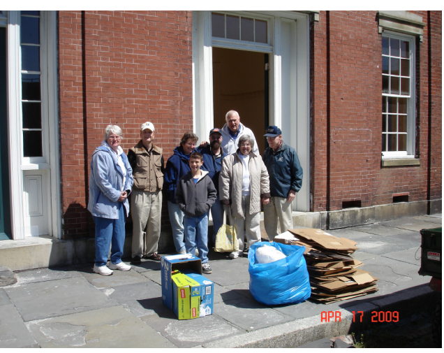
Ready for the 2009 Season!!