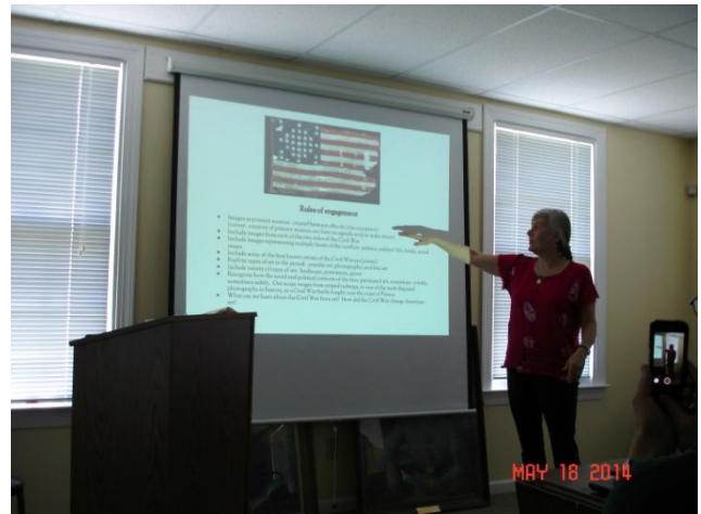
Art in the U. S. Civil War