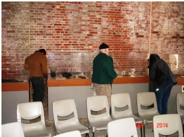
Society Museum Cases inside Fort Delaware