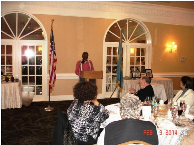
Annual Meeting Guest Speaker