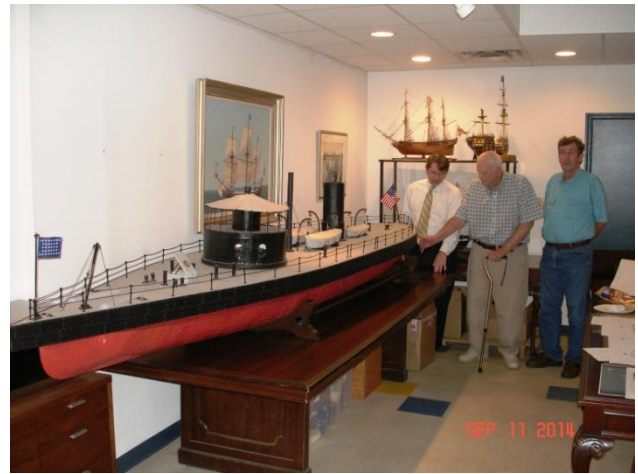
Model of the USS Saugus