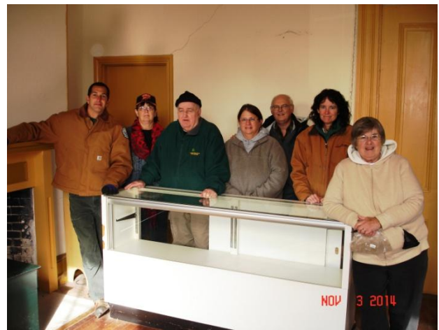
Final Closing of the Society's Sutler Shop