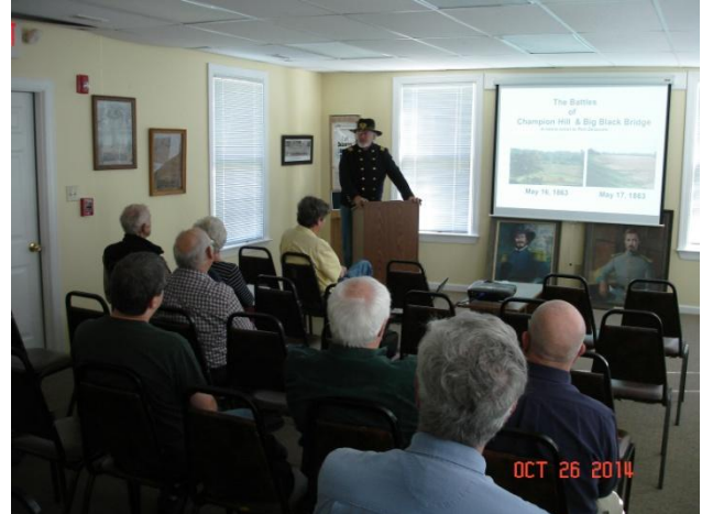
Champion Hill and Big Black Bridge