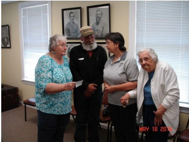
Steele Family Memorial Contribution