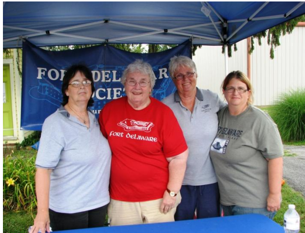
Peach Festival Outreach Wyoming, Delaware