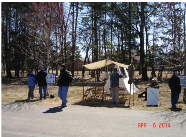
Neshaminy Creek Outreach Table