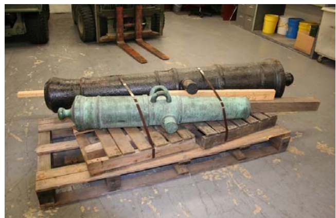
Palletted for Storage