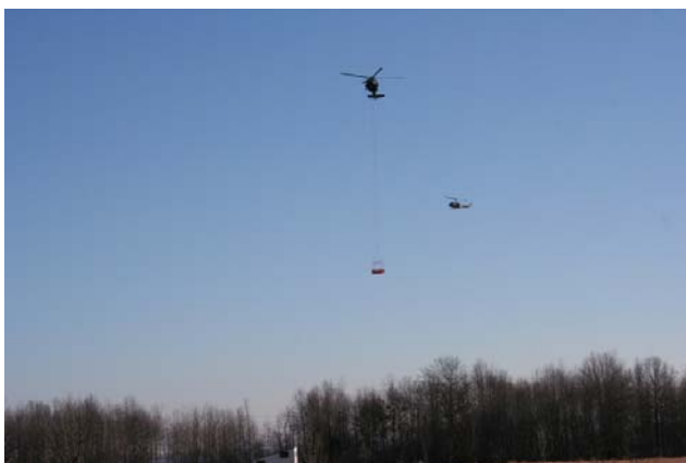
In Transit from Pea Patch Island