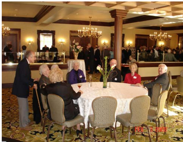
The Reception Area Before Lunch