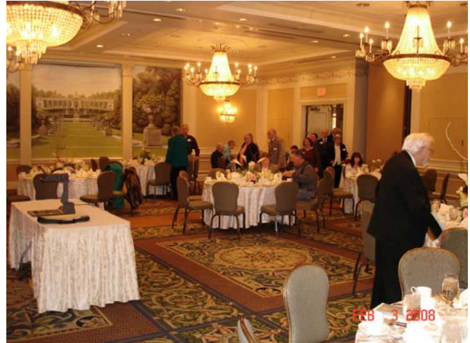
Members Entering the Dining Rooms